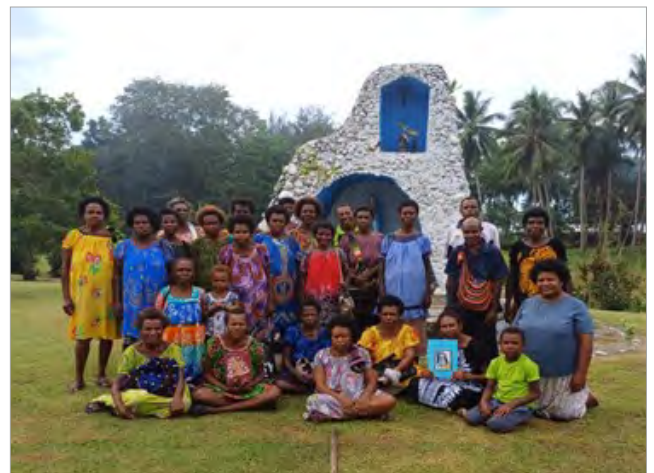
The newly established Mercy Friends group of Dagua Parish, East Sepik.