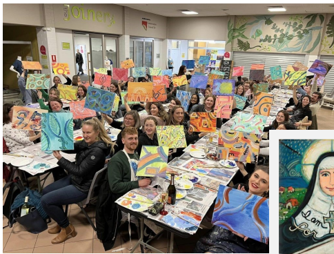
Paint and Sip Fundraiser organised by Young Mercy Links South Australia