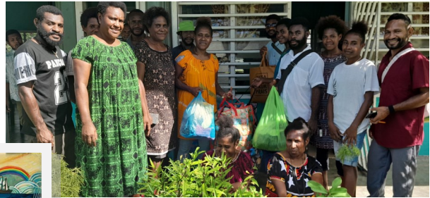
Mercy Friends in PNG gathering donations towards the earthquake disaster in 2023