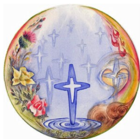
Mercy Mandala of Great Britain, by the Srs. of Mercy of Great Britain.

For the circle of Mercy is timeless It is Spirit of Life itself Which roots us in faith And lifts us in hope, And holds us in God's loving care (repeat this last line)