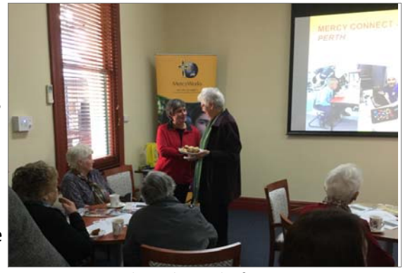
Presentation about the work of Mercy Connect in schools in Perth.