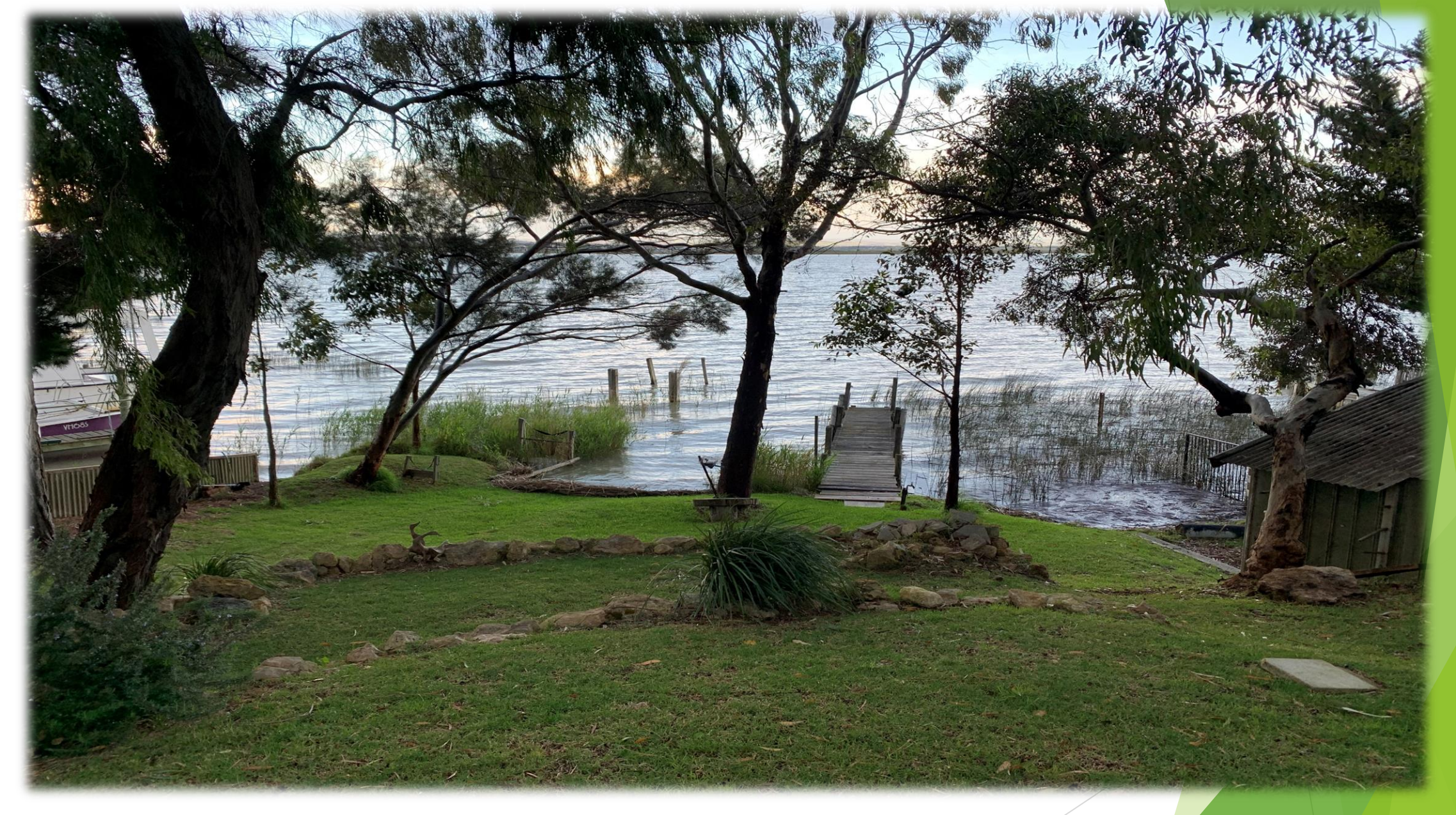
Blessed are trees with whom we share 50% of our DNA.