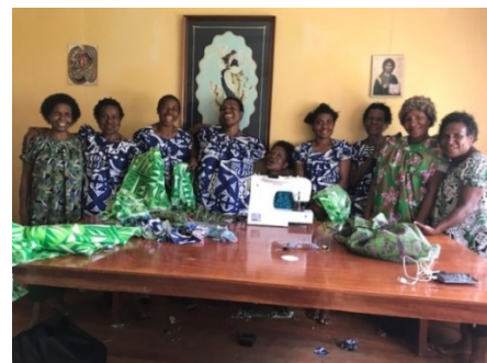
A Group of Goglme Women Learn Machine Sewing