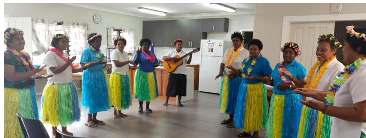
22-30 JUNE 2021: STUDENTS PERFORM A DANCE OF THANKS AT THE CONCLUSION OF THE FIRST CLASS IN HONIARA, SOLOMON

8 students registered in the AdvDipTheol&PastMin . More will register at the next class.