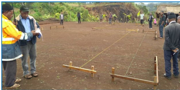
4 th Cookhouse at Posulim site Southern Highlands PNG

This committee meets regularly and functions well