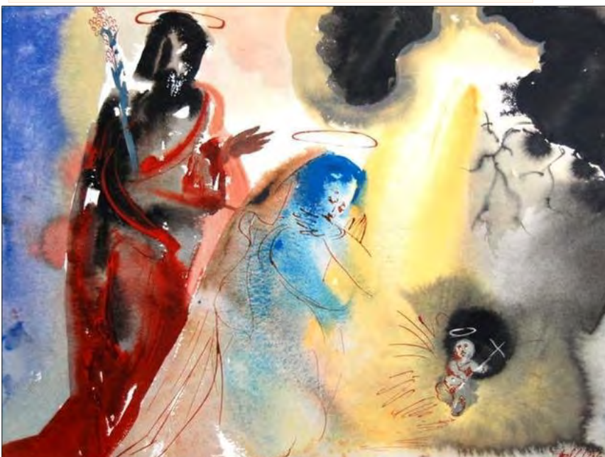
Image: Salvador Dali, The Birth of Jesus

14 And the Word became flesh and lived among us, and we have seen his glory, the glory as of a father's only son, full of grace and truth.