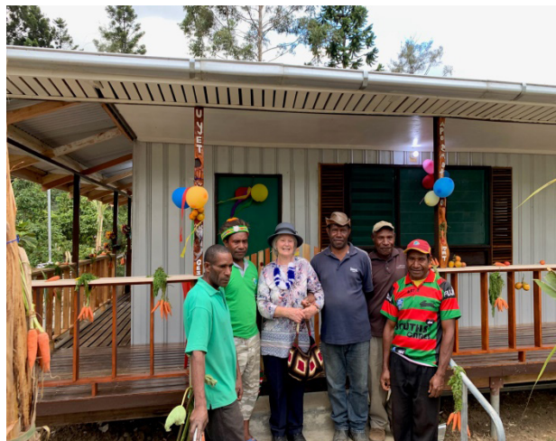
The opening of the Goglime Cookhouse