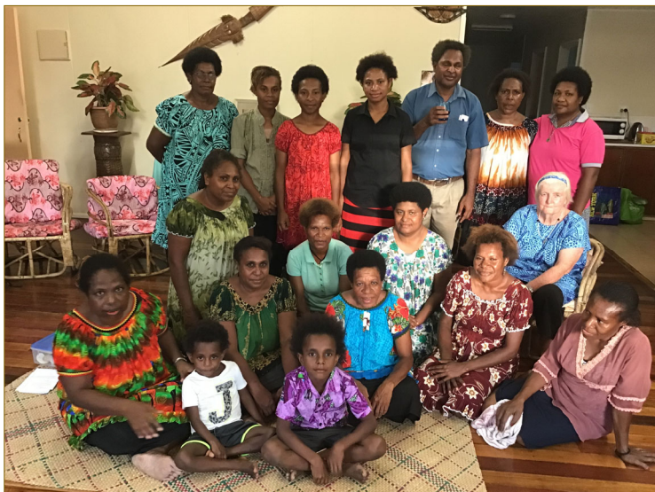
Mercy Day at Mercy Secondary School in Yarpas, with the Mercy Friends celebrating Mercy Day in the convent.