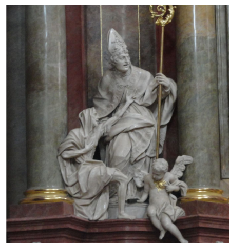
Ros Trestrail, Tuart Hill (Perth)

If you look closely at the photo at right, taken inside Poznan Cathedral, you will notice the angel is looking at a black mobile phone. This obviously would not have been in the original sculpture but maybe in modern times it could be a reminder to us— sometimes we can become so distracted by things, we neglect to notice the amazement God has put all around us.