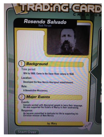
Sample from the Trading Cards website