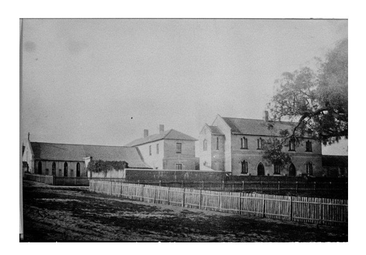
The 1848 Convent of Mercy (middle building), which is where the St Joseph's Catholic Girls' Orphanage began. Source State Library of Western Australia, BA1886/797

http://purl.slwa.wa.gov.au/slwa_b3033226_1.jpg