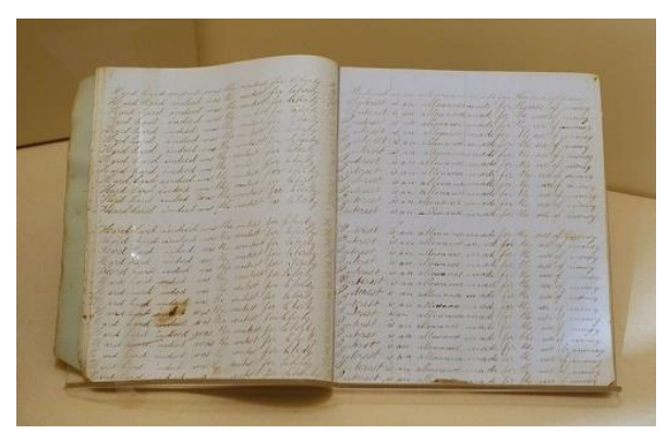
A copybook used in Boston, USA, around 1840

http://purl.slwa.wa.gov.au/slwa_b3033226_1.jpg