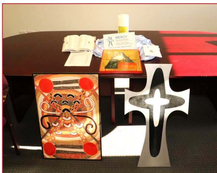
Focus - Launch of the ISMAPNG Mercy Associates 2016