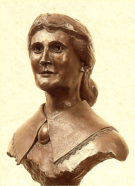
Catherine McAuley Foundress of the Sisters of Mercy

My God, I am yours for time and eternity, Lord, I am yours forever. It is you who must teach me to trust in your providence, loving Lord. You are a God of love and tenderness. I put my faith in you. And I ask that you grant me acceptance of your will, loving Lord. Take from my heart all painful anxiety, Let nothing sadden me but sin and let delight be hoping to see your face God, my all.