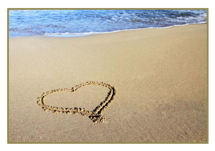
"A new heart I will give you and a new spirit I will put within you; and I will remove from your body the heart of stone and give you a heart of flesh." [Ezek. 36:34]

PRAYER SUGGESTION: In reflecting on the following passage, the symbols below may be useful.