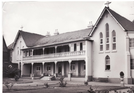
Convent of Mercy, Goulburn

In 1859 when the Sisters arrived at the invitation of the Catholic clergy, Goulburn was the centre of a parish that extended into Tasmania. As women from the local Catholic families began joining the Congregation, the Sisters were able to move to more towns in the parish. A list of the places where the Sisters established communities and took on responsibility for pastoral work and schools gives an indication of the spread of the Catholic population and the desire of the clergy and of the sisters to minister to their needs. Between 1859 and 1948 Mercy convents were founded in Albury, Yass, Boorowa, Cootamundra, Young, Murrumburrah, Tumut, Junee, Gundagai, Grenfell, Deniliquin, Corowa, Wilcannia, Wodonga, Deloraine, Wyalong, Gunning, Jerilderie, Crookwell, Tocumwal, Barmedman, Galong, Stockinbingal, Bethungra, Finley, Goolongong, Murringo, Griffith, Dee Why, Henty, Binda, Howlong, Captains Flat and Braddon. The sisters ministered – and continue to minister today - in the fields of education, health care, prison visitation and welfare.