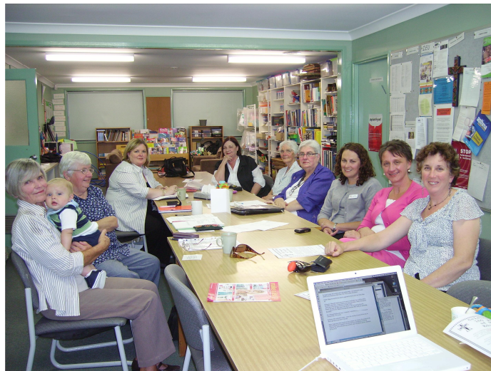
Goulburn Planning Group:

Overall planning for the sesquicentenary weekend has been in the hands of a committee from the schools, parish and sisters. This group is working enthusiastically to gather information, share resources and plan the October functions. Thanks to the hospitality of the staffs of Sts Peter and Paul's and Trinity Catholic College, there is always a place for the group to meet.