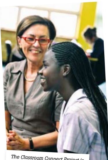
The Classroom Connect Project is empowering refugee students.

The MDGs do not explicitly refer to the needs of refugees, asylum seekers and Indigenous Peoples, but these groups are often particularly affected by poverty. Mercy Works Inc. believes that the interests of these groups are at the heart of each of the MDGs. In 2008-2009, Mercy Works Inc. continued its support of refugees and Indigenous communities in Australia through the Classroom Connect Project, the African Refugee Farming Project, and the Fraynetwork Indigital Music Programme.