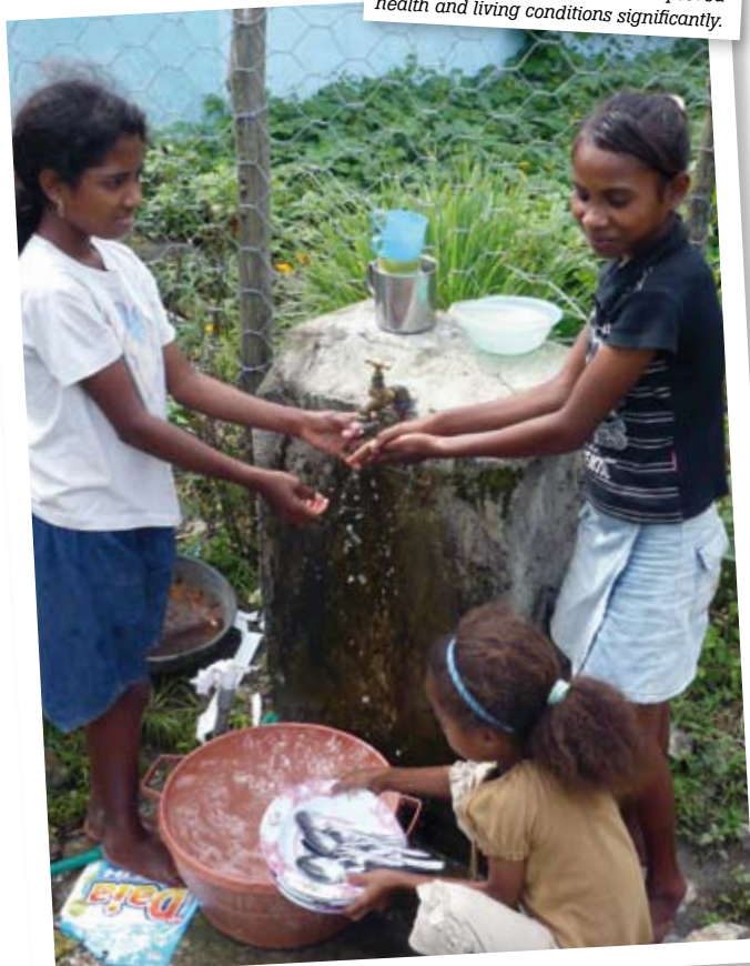
The Fohorem water project has improved health and living conditions significantly.