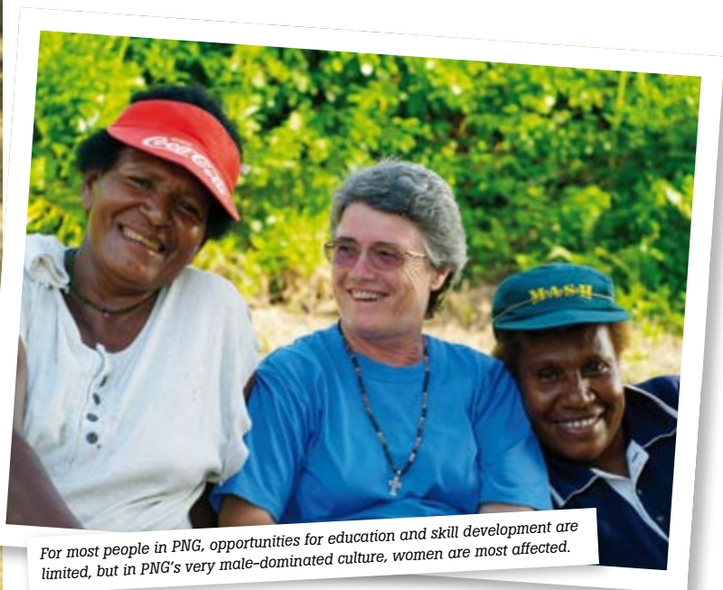
For most people in PNG, opportunities for education and skill development are limited, but in PNG's very male-dominated culture, women are most affected.