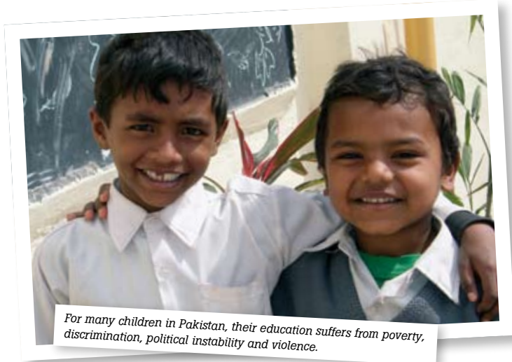
For many children in Pakistan, their education suffers from poverty, discrimination, political instability and violence.

situation is exacerbated in the remote Western Province because of poor infrastructure and lack of community services.