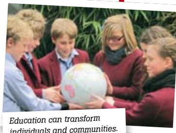
Education can transform individuals and communities.

Community education also occurs through our magazine The Bilum , our website www.mercyworks.org.au and other promotional materials.