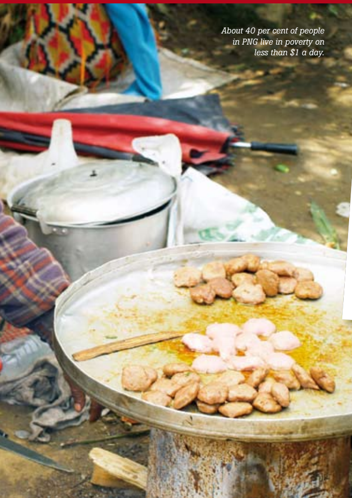
About 40 per cent of people in PNG live in poverty on less than $1 a day.